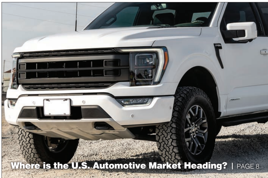
Where is the U.S. Automotive Market Heading? | PAGE 8