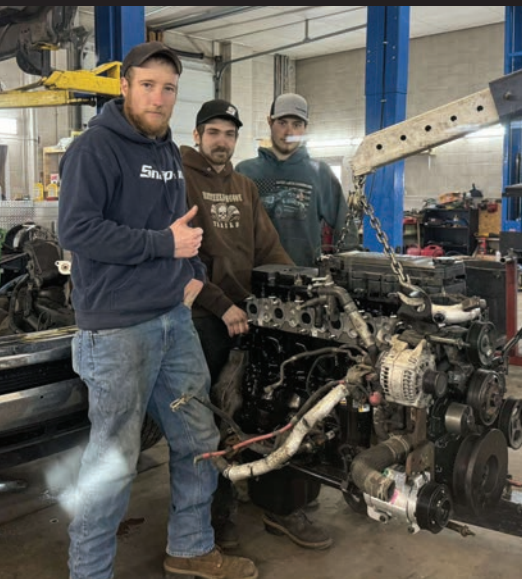
The camshaft and other major components on Kane's heavy-duty pickup truck were still in spec after 500,000 miles (804,672 km) of hard use.